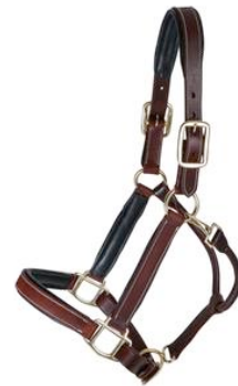
Padded Leather Halter