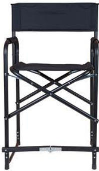
Tall Folding Director's Chair