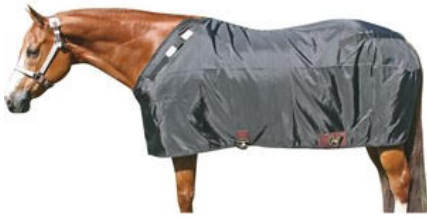
Original Cutback Sheet

***PHONE CALLS or EMAILS ONLY PLEASE!!!***