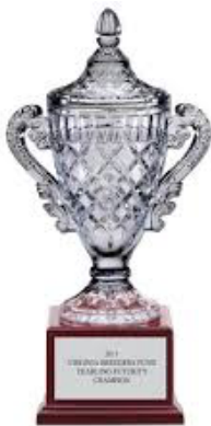
Crystal Award Trophy